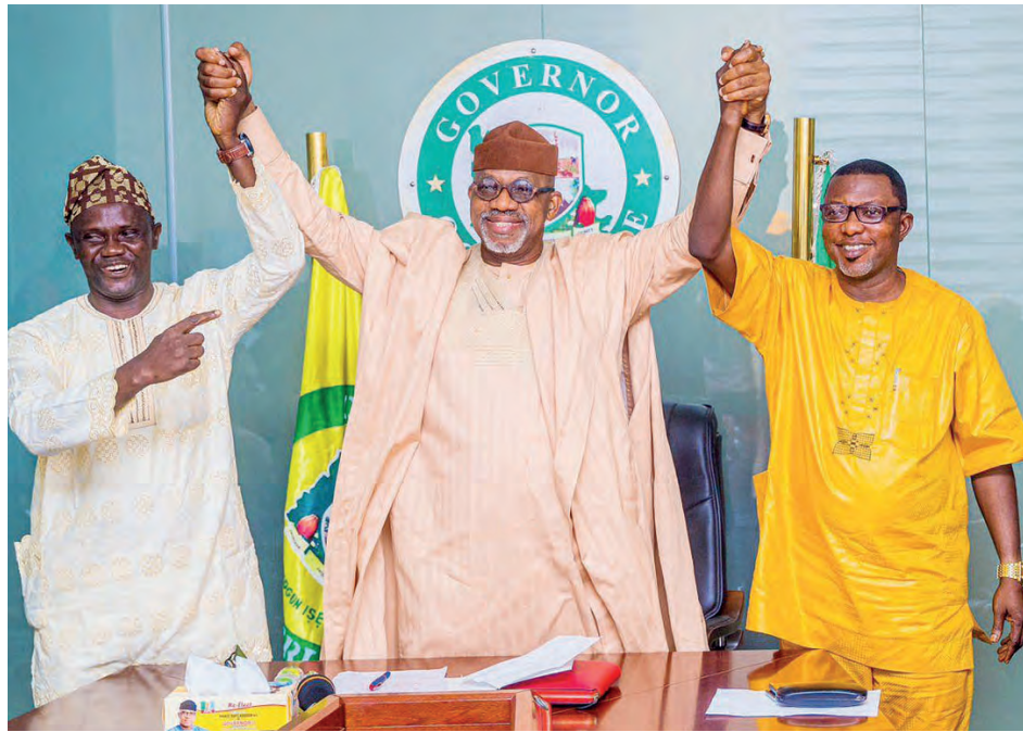
L-R: The Ogun State chairman of Labour Party, Micheal Asade; Governor Dapo Abiodun and the National Publicity Secretary of Labour Party during the endorsement and adoption of Governor Abiodun for second term and the Governorship candidate of Labour Party for March 18 gubernatorial election in Ogun State on Friday.

"As the Chief security officer, the governor has demonstrated that all lives matter and