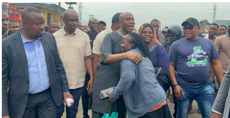
Former Minister of Transportation, Chibuike Rotimi Amaechi, campaigns for the Rivers State governorship candidate of the APC, at Elekahia Mechanic Village, Ikoku Spare Parts Market, Ojoto, Okija and other parts of D/Line-Diobu axis in Port Harcourt.

The traders pledged their support for the APC's Cole, stating that