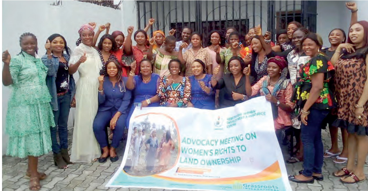
A cross section of women during the IWD celebration in Port Harcourt

The Executive Director explained that due to lack of financial empowerment more women became vulnerable