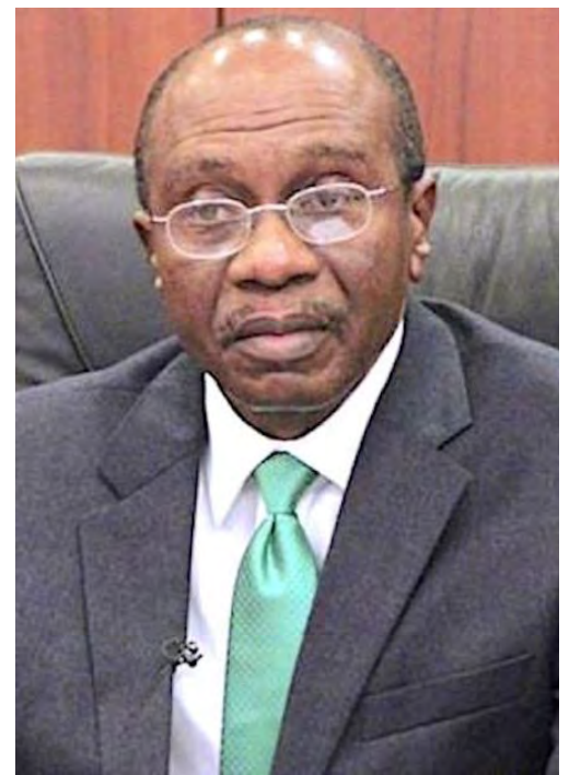
Godwin Emefiele, CBN, governor