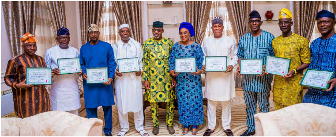
L-R: House of Representatives' members elect: Adegbesan Joseph (Ijebu-North/East/Ogun Waterside); Gboyega Nasir Isiaka (Yewa North/Imeko-Afon); Olumide Osoba (Obafemi/Owode/Odeda/Abeokuta North); Isiaka Ibrahim (Ifo/Ewekoro); Governor Dapo Abiodun; Adewunmi Onanuga (Remo); Isiaq Akinlade (Yewa South/Ipokia); Tunji Akinosi (Ado-Odo/Ota); Afolabi Afuwape (Abeokuta South) and Femi Ogunbanwo (Ijebu Central) displaying their certificates of return during an All Progressives Congress victory parley at the Governor's country home, Iperu-Remo, Ikenne Local Government Area of Ogun State on Friday.