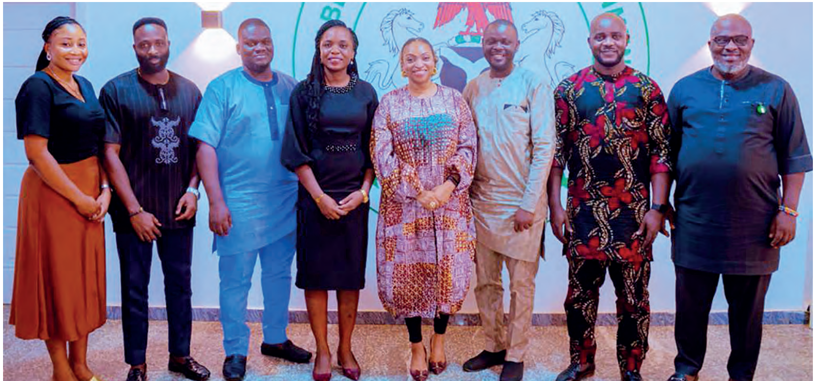
Members of the Presidential Enabling Business Environment Council (PEBEC).

The new law promotes Transparency and Efficiency in Public Service Delivery and strengthens ease of doing business across the country.