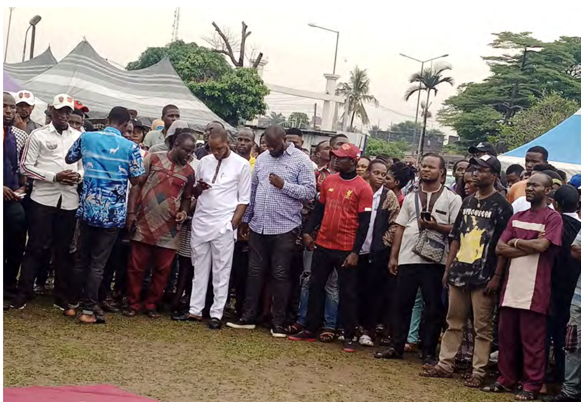
Crowd of youths

“The summit heartily and most respectfully salutes the Executive Governor of Rivers State, His Excellency, Nyesom Wike, for his tireless commitment to good governance and safeguarding the interest of Rivers State.” The body passed ‘Vote of Confidence’ on Gov Wike allegedly