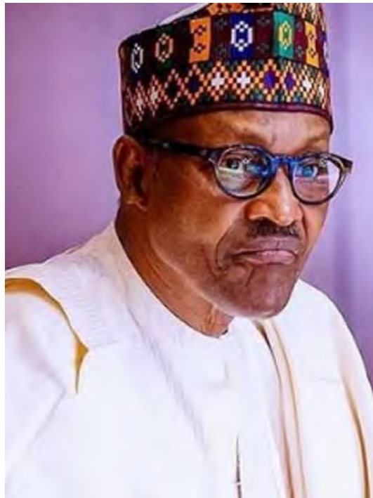
President Muhammadu Buhari