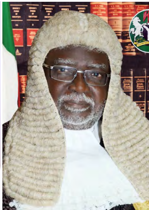
Olukayode Ariwola, chief justice of Nigeria