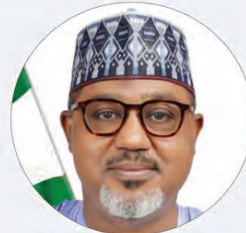
Hon. Umar El-Yakub Hon. Minister of State Works and Housing