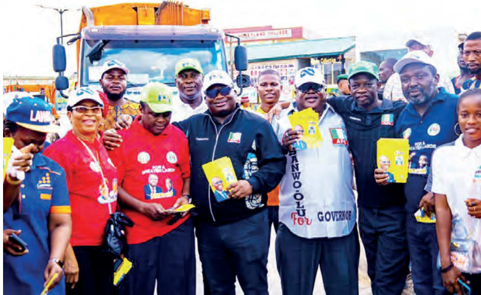
A cross section of the participants at the event.

government's plan is to provide the PSP operators with low-interest loans to purchase new trucks. The government will also provide technical assistance to the PSP operators to help them manage their fleet more efficiently. "It will also stimulate economic growth by providing opportunities for small businesses to thrive. By providing the PSP operators with low-in-